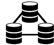
Data Cloud Nodes

Regular nodes that participate in the voting process and keep Supernodes in check, Voternode tiers are based on the amount of CPX staked.