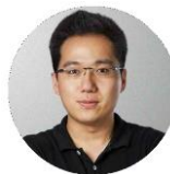
- Jimmy Hu APEX Network CEO

“APEX Network’s Data Cloud Nodes not only play an integral role functionally for the ecosystem, but more importantly in a decentralized manner advances the state of consumer data ownership and privacy, a fundamental component in our vision.”